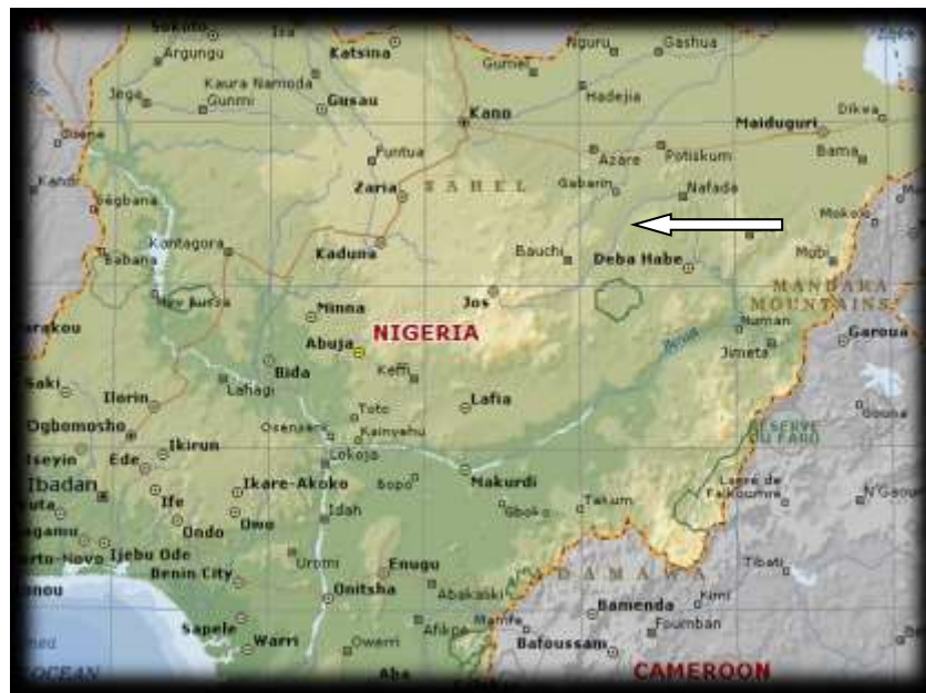
Map of Nigeria showing Zaria arrowed.

Zaria is made up of the following wards: Zaria-City, Tudun Wada, Kongo/Gyallesu, Tudun Jukun, Tukur Tukur, Wusasa, Sabon Gari, Muchia/Chikaji, GRA, Kwangila, Hanwa, Palladan, Samaru and Zango.